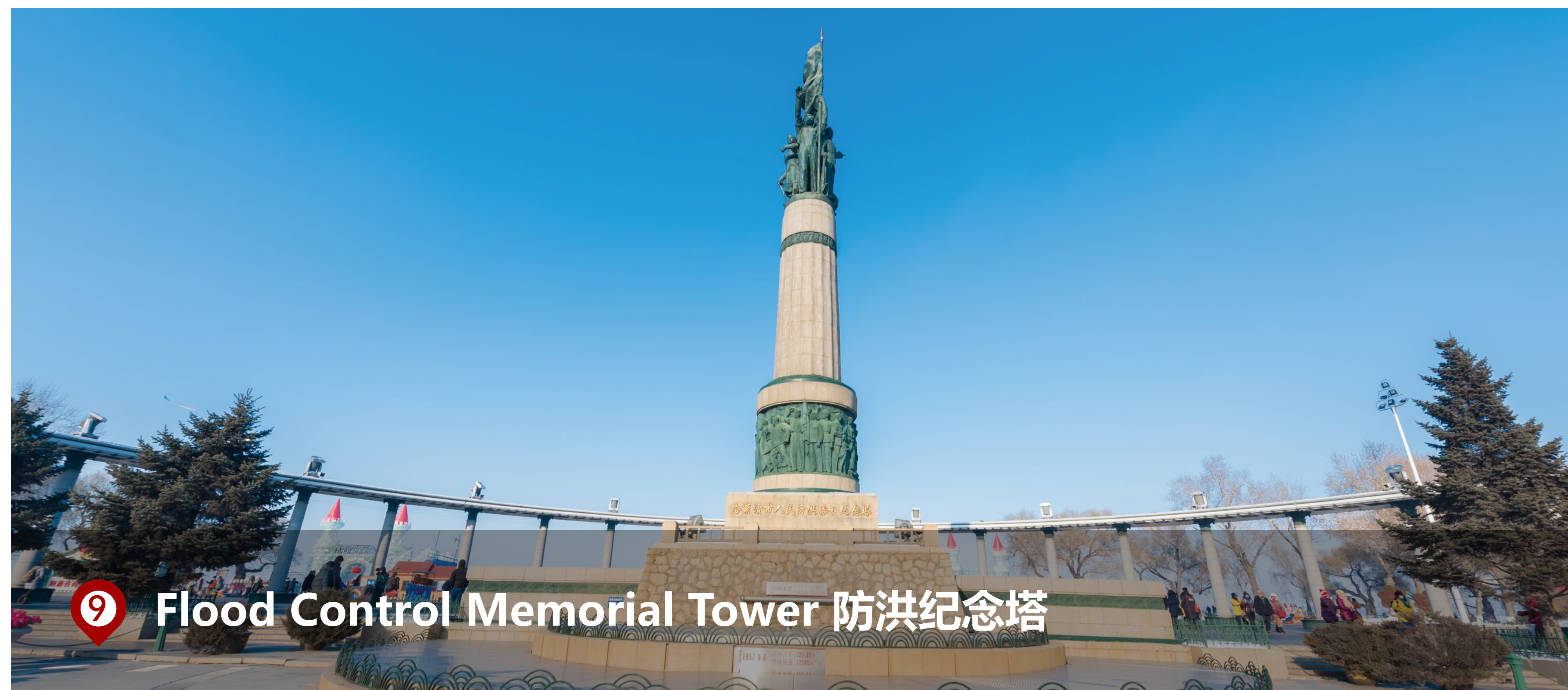
9 Flood Control Memorial Tower 防洪纪念塔