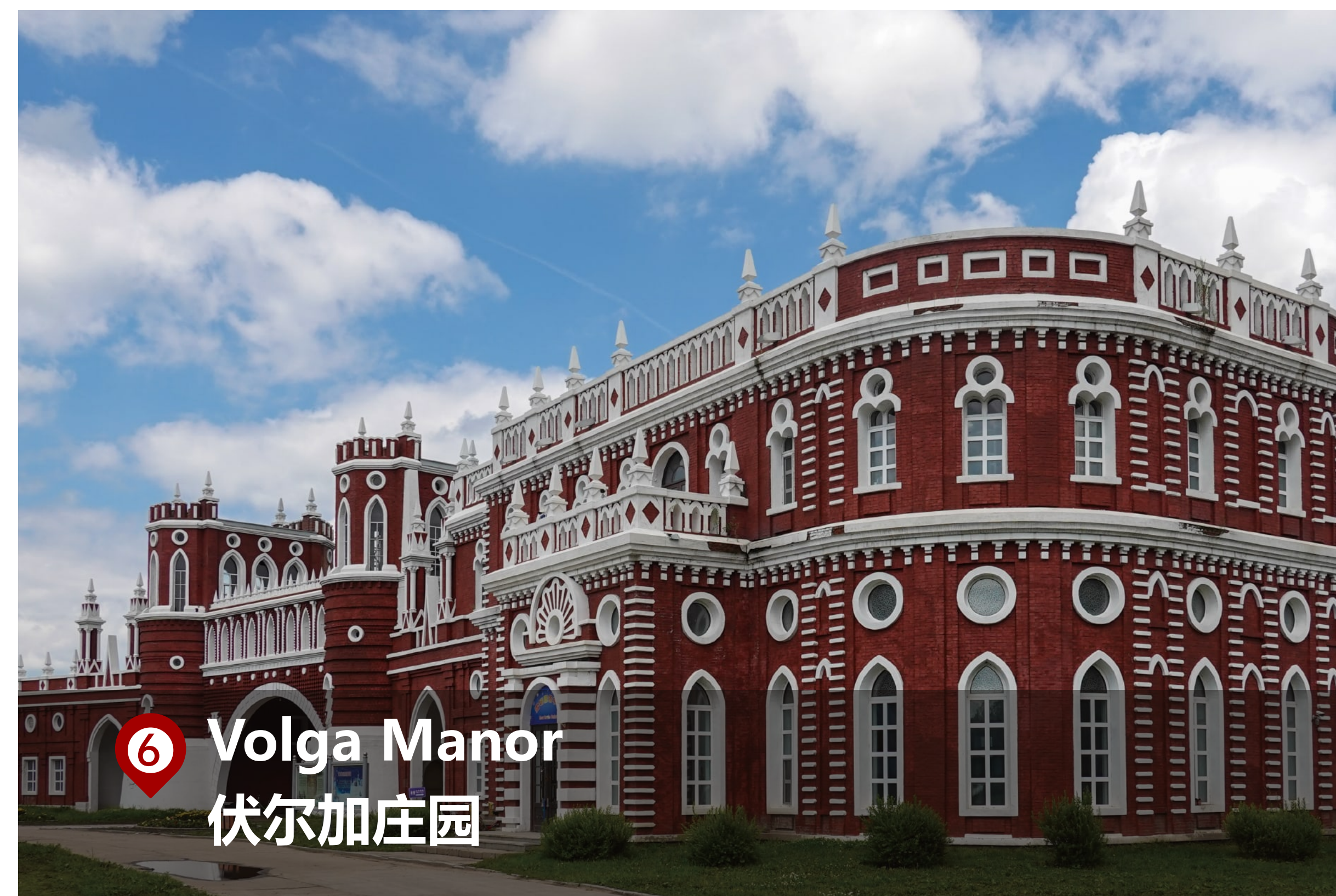
⑥ Volga Manor 伏尔加庄园