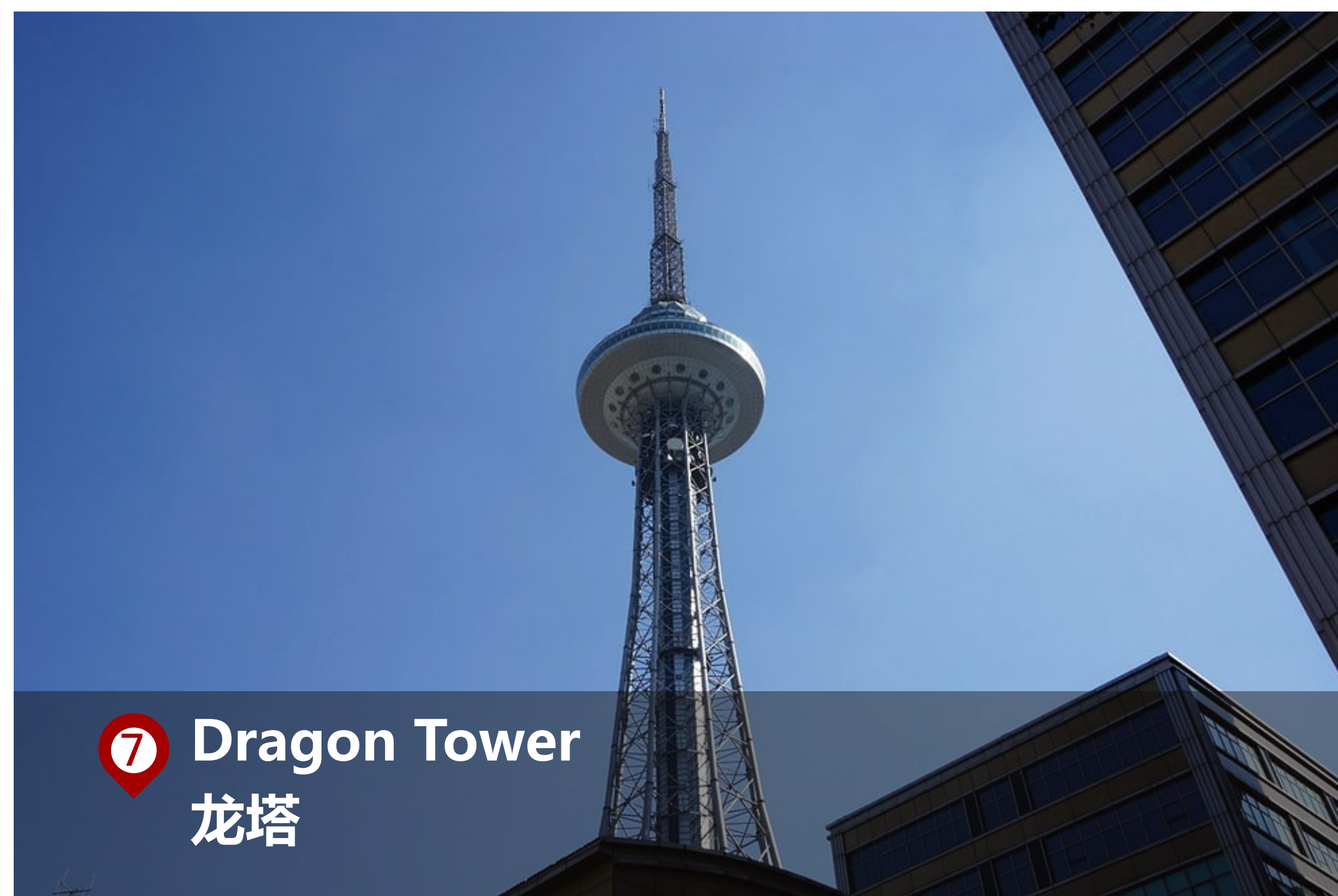
⑦ Dragon Tower 龙塔