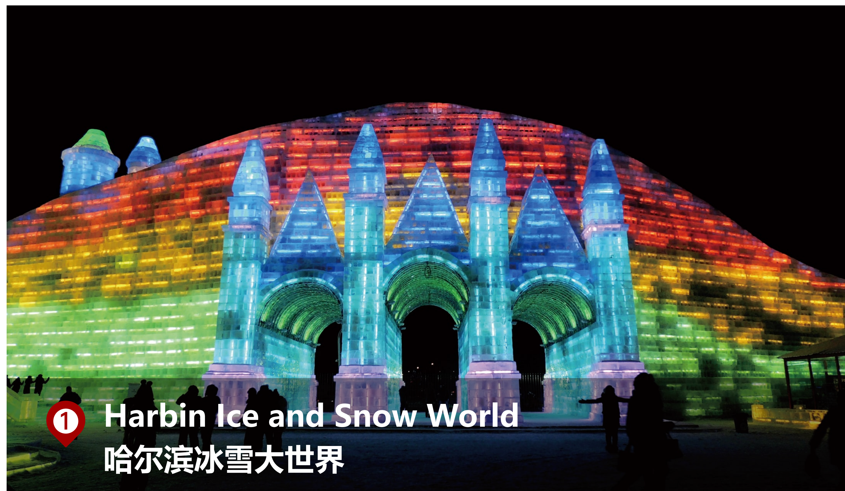
① Harbin Ice and Snow World 哈尔滨冰雪大世界