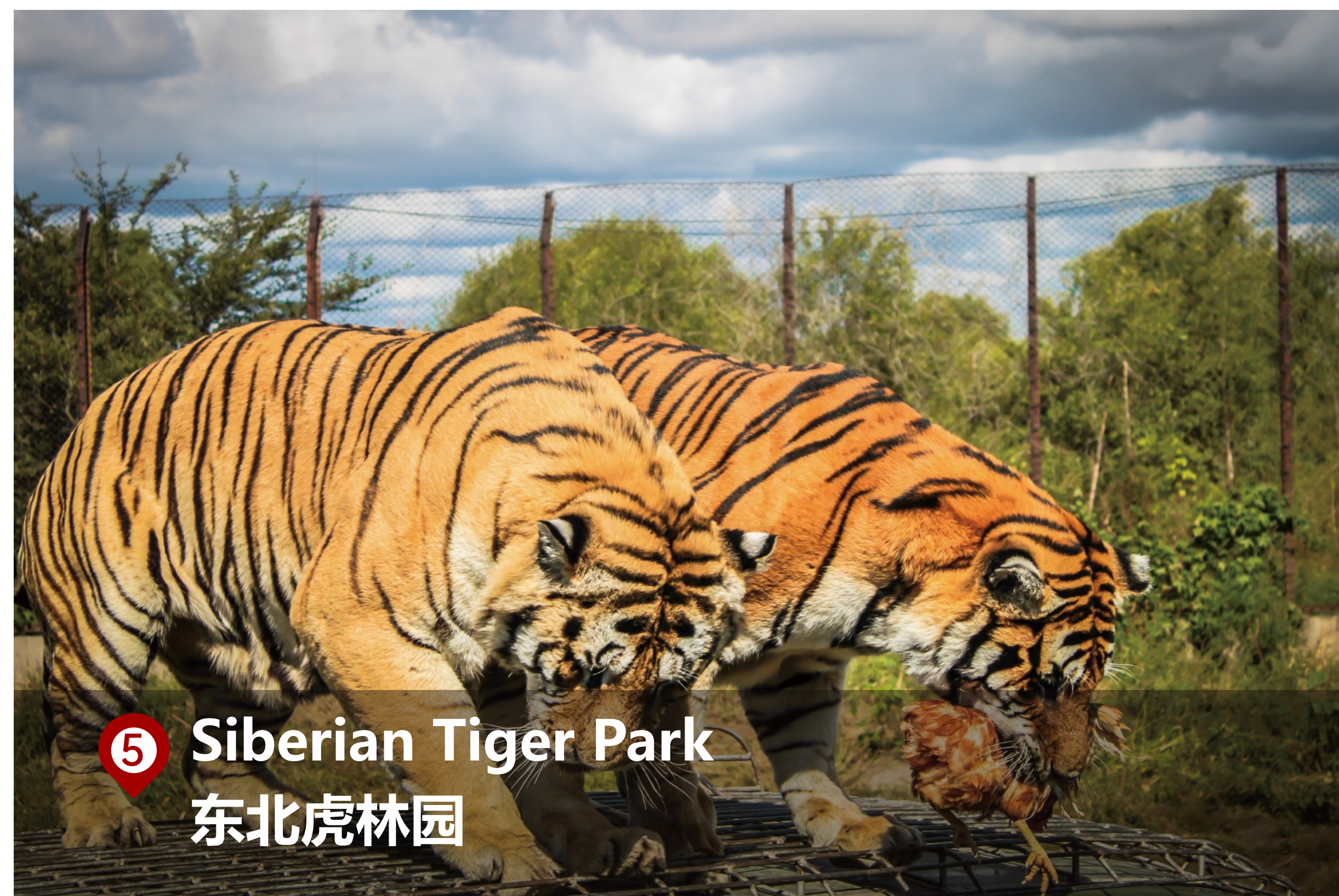
⑤ Siberian Tiger Park 东北虎林园