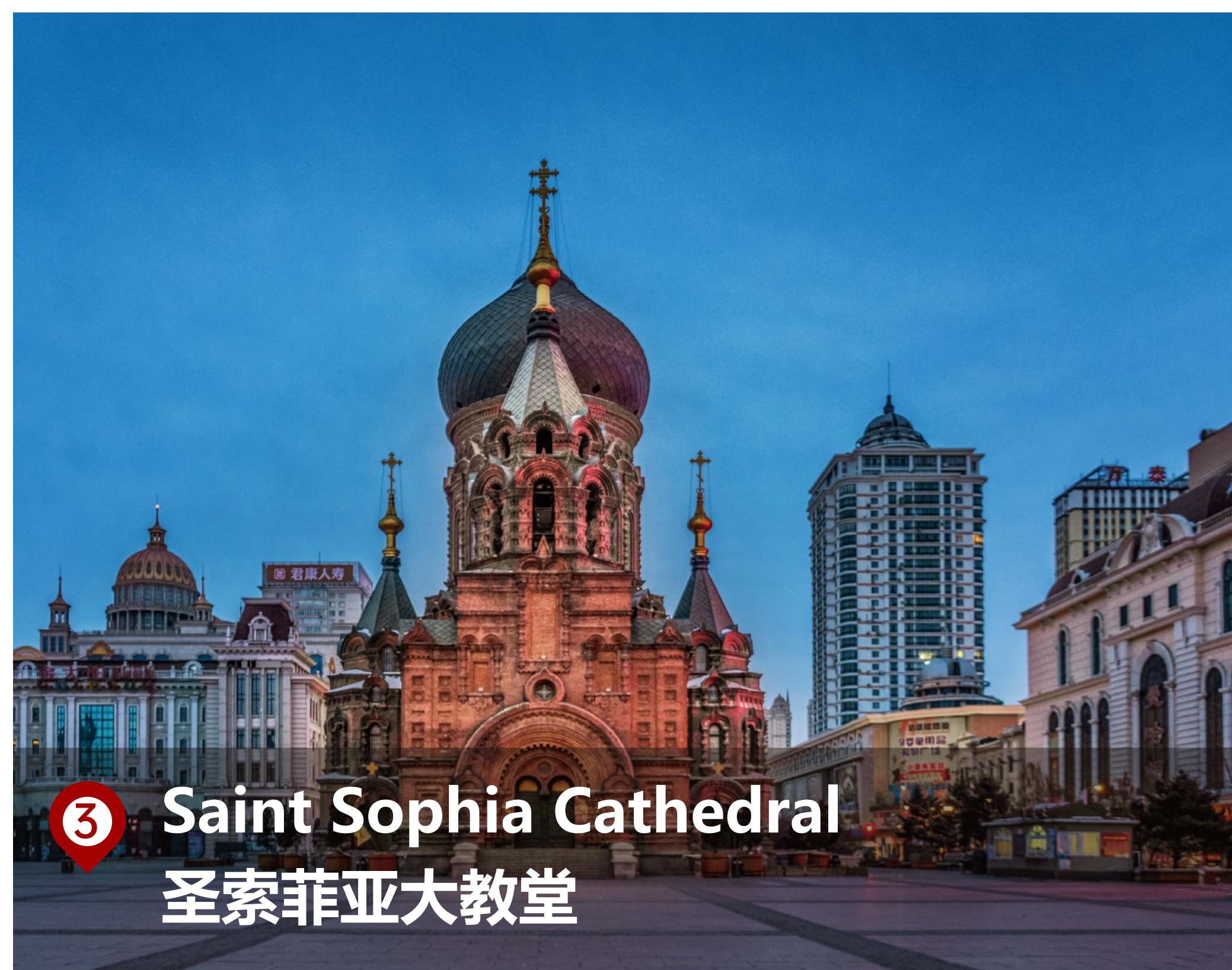
③ Saint Sophia Cathedral 圣索菲亚大教堂