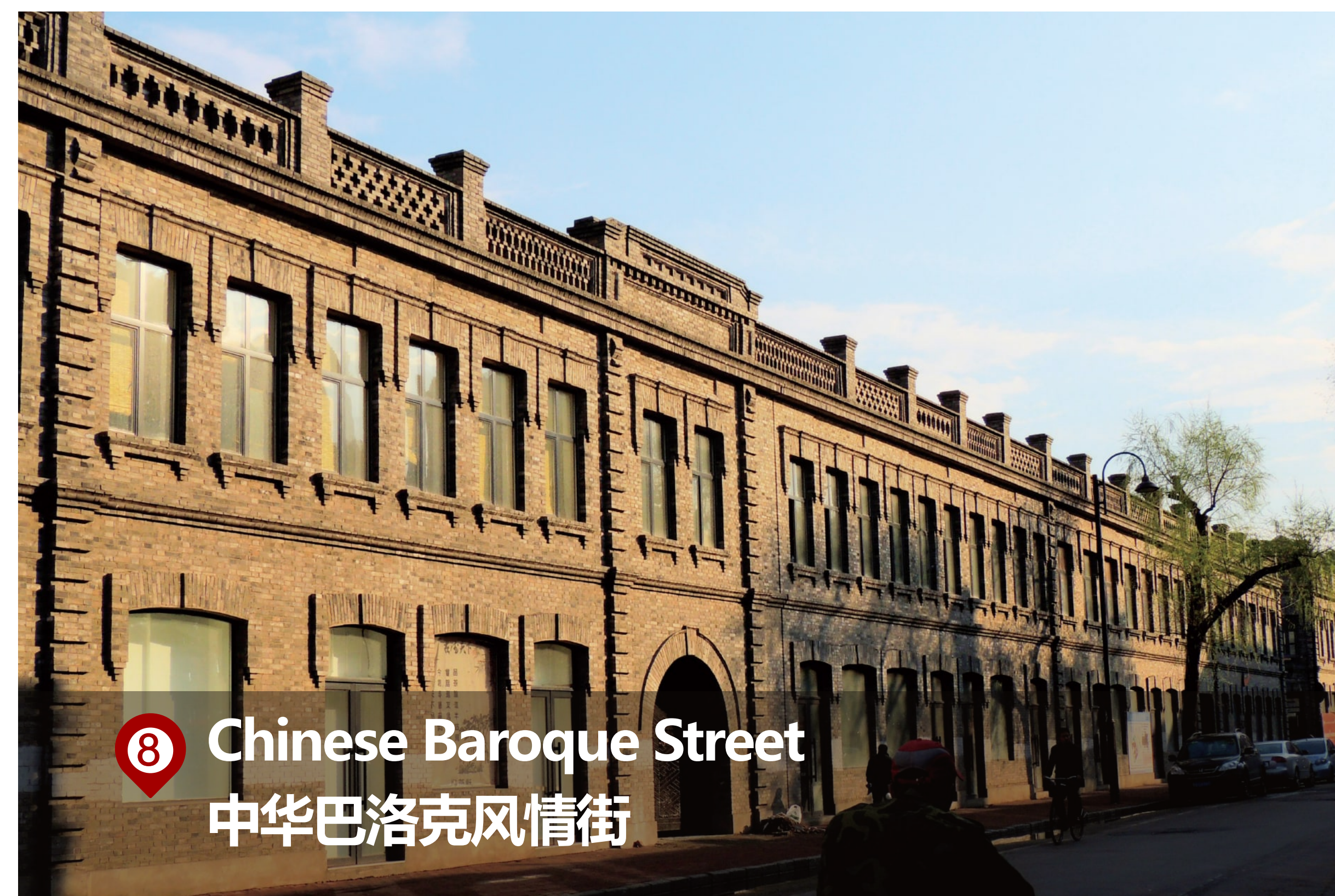
⑧ Chinese Baroque Street 中华巴洛克风情街