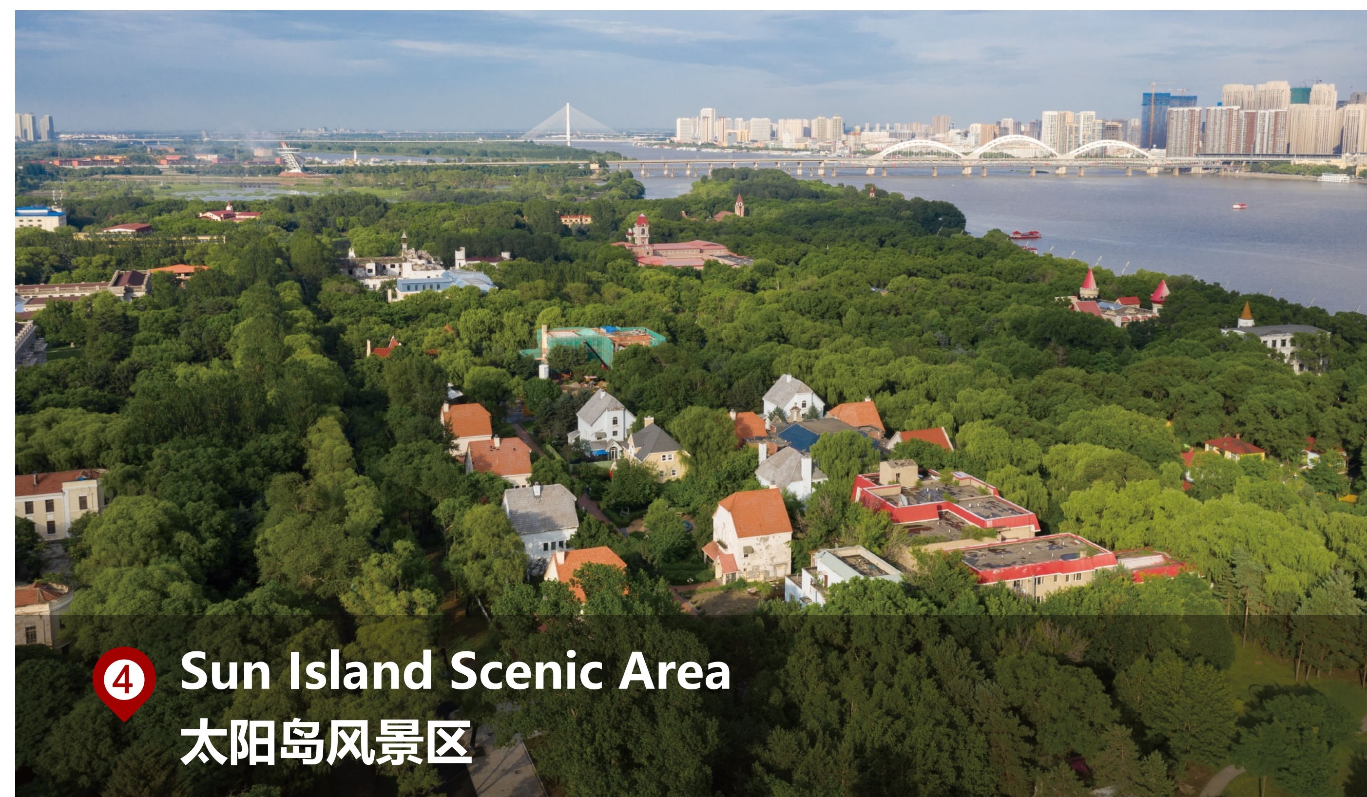
④ Sun Island Scenic Area 太阳岛风景区