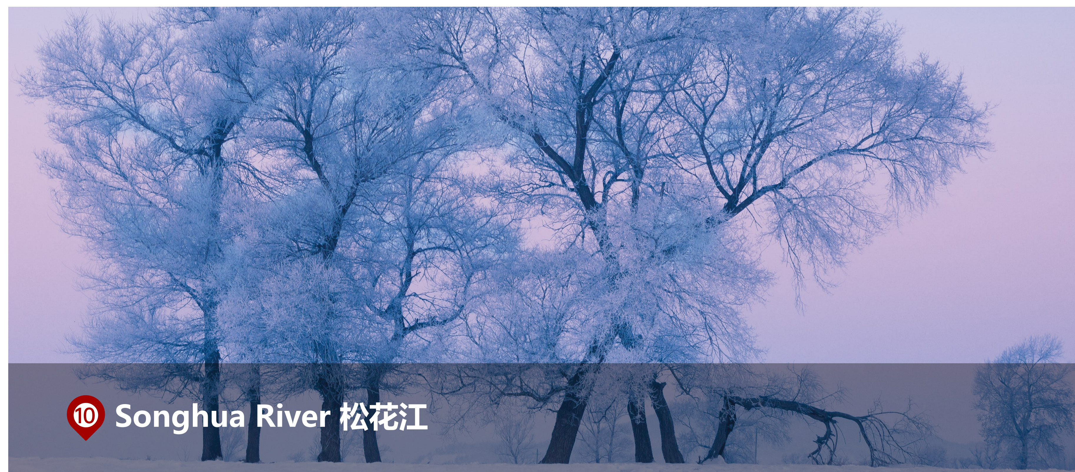
10 Songhua River 松花江