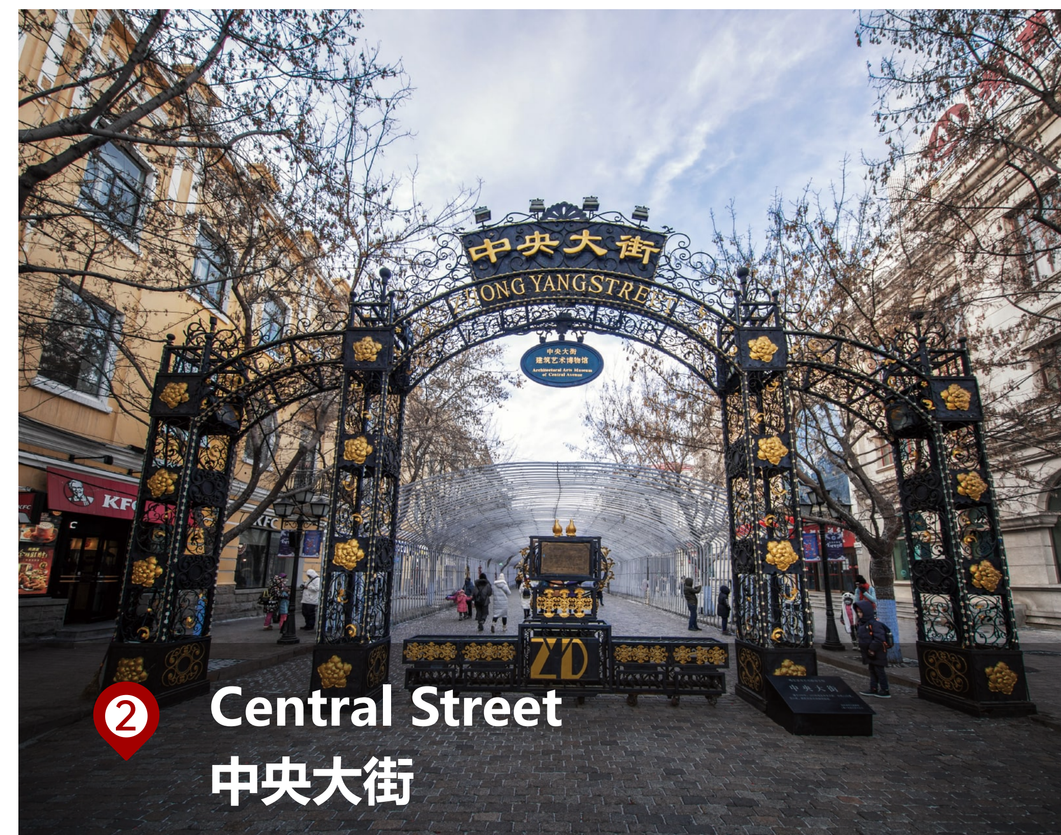
② Central Street 中央大街