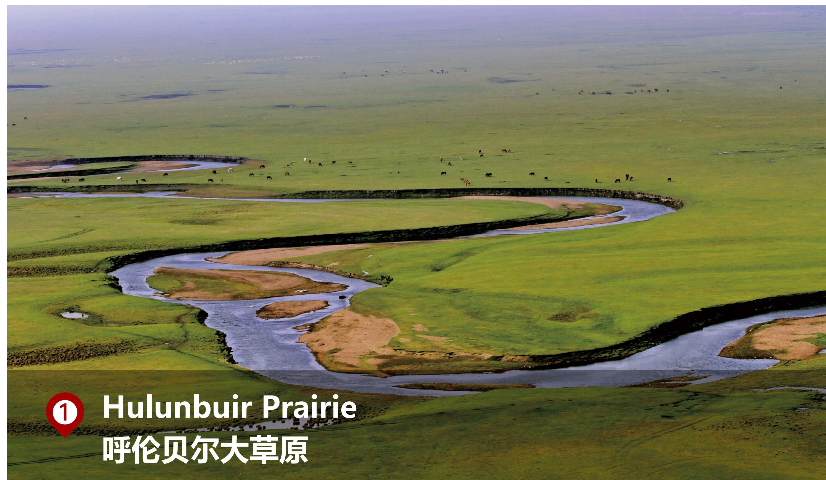
① Hulunbuir Prairie 呼伦贝尔大草原