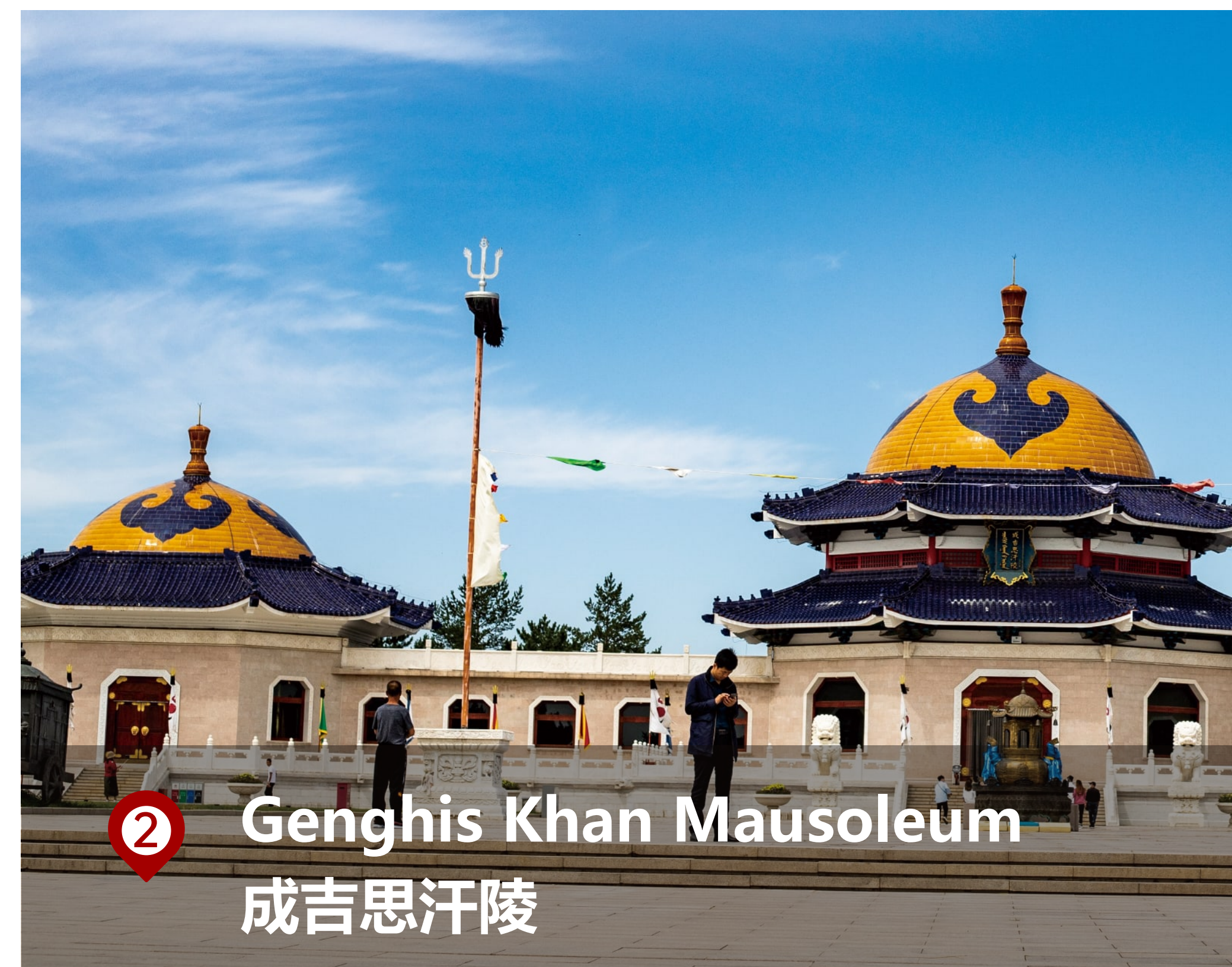
② Genghis Khan Mausoleum 成吉思汗陵