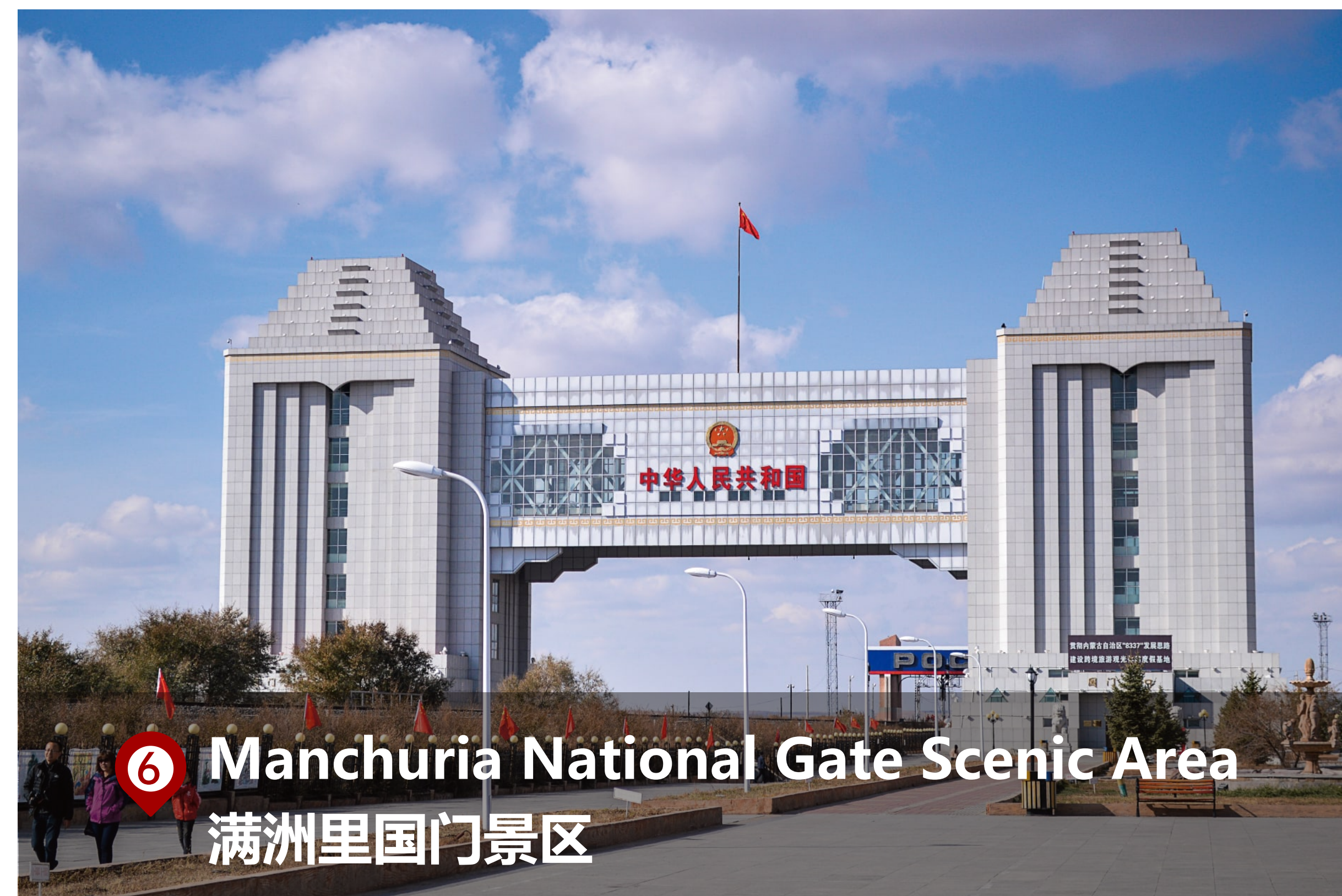
⑥ Manchuria National Gate Scenic Area 满洲里国门景区