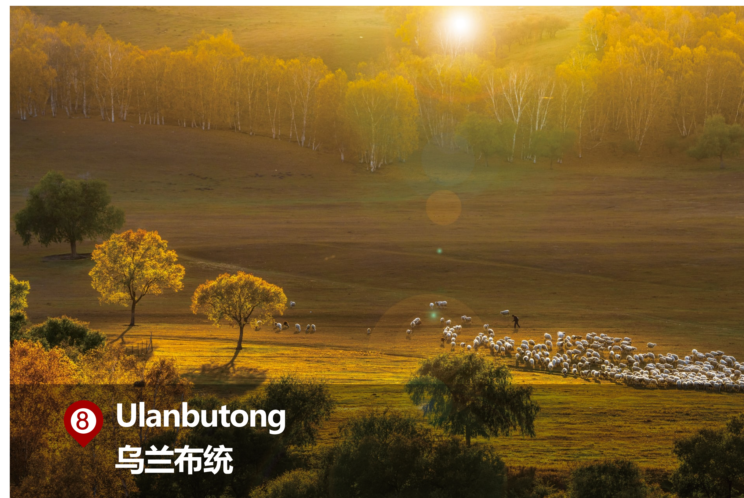
⑧ Ulanbutong 乌兰布统