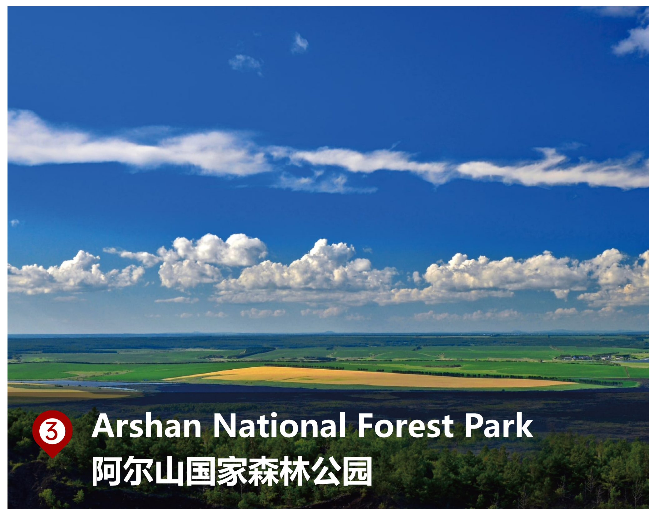
③ Arshan National Forest Park 阿尔山国家森林公园