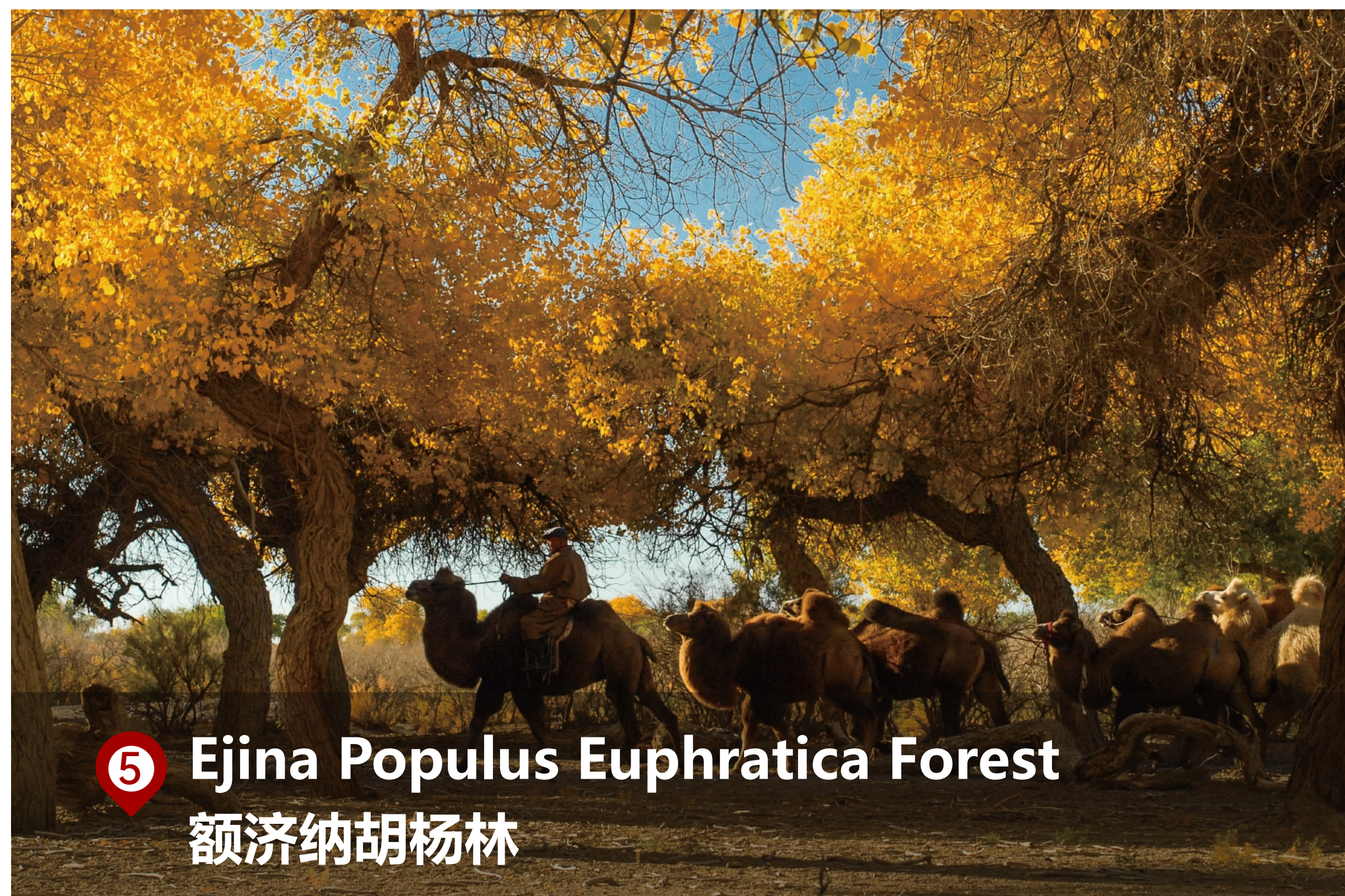
⑤ Ejina Populus Euphratica Forest 额济纳胡杨林