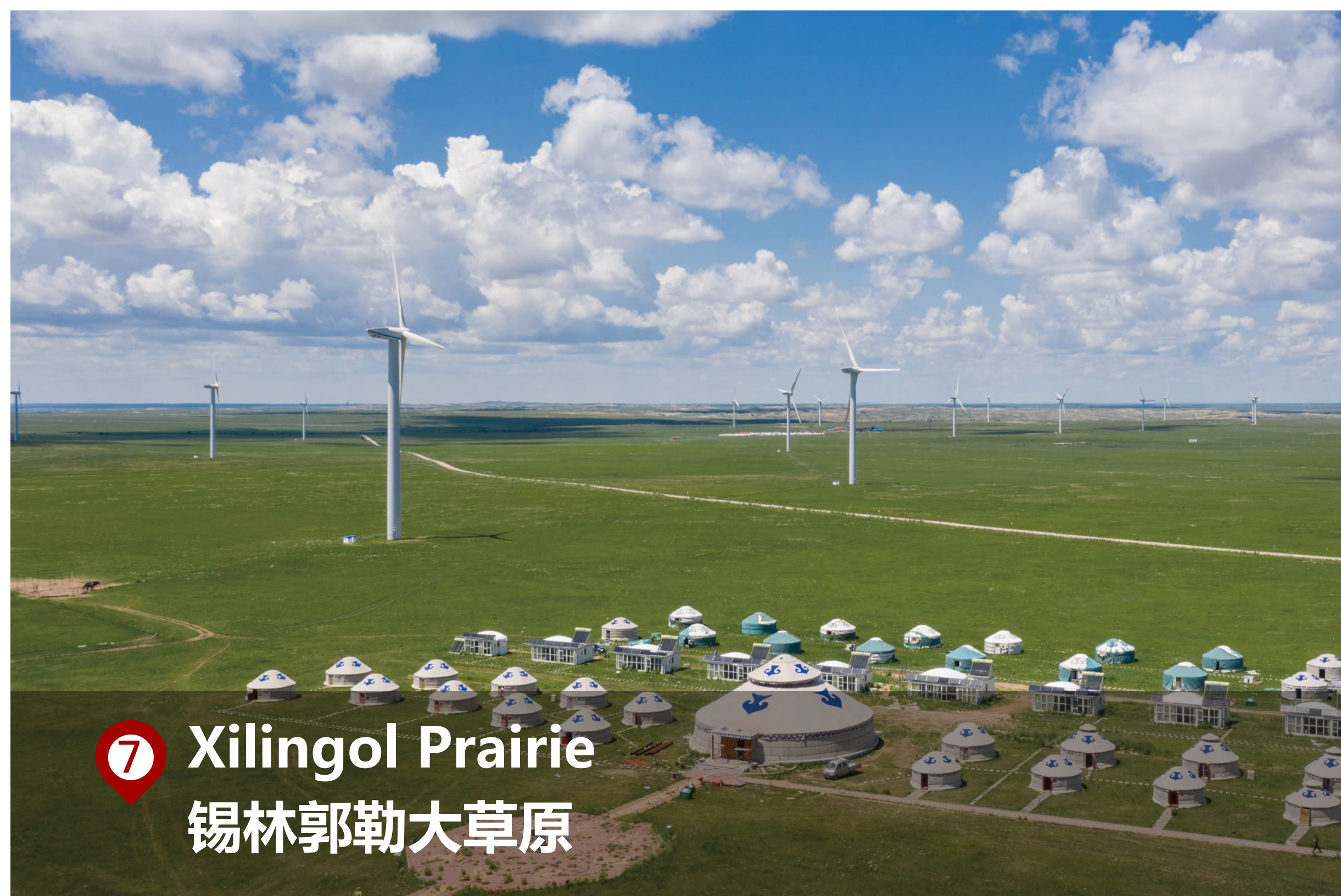
⑦ Xilingol Prairie 锡林郭勒大草原