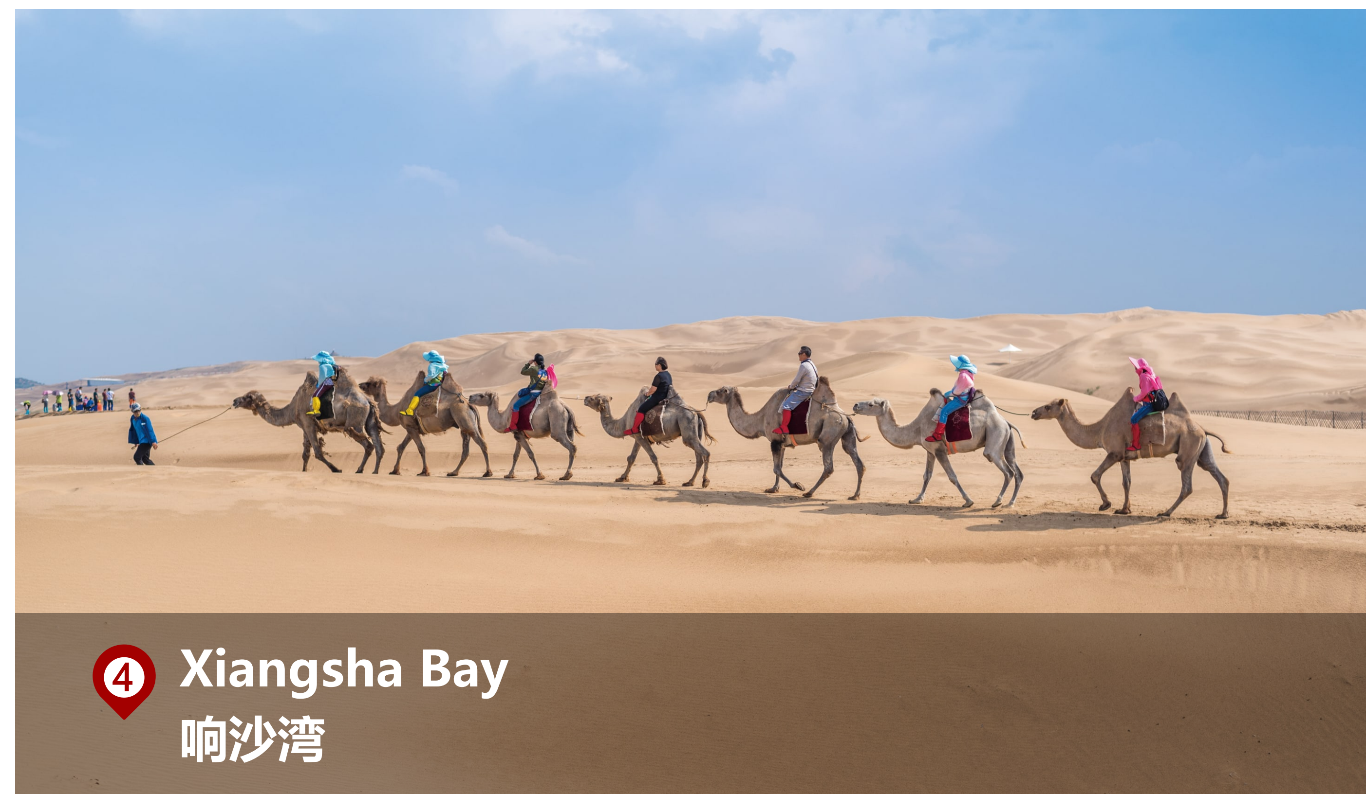
④ Xiangsha Bay 响沙湾