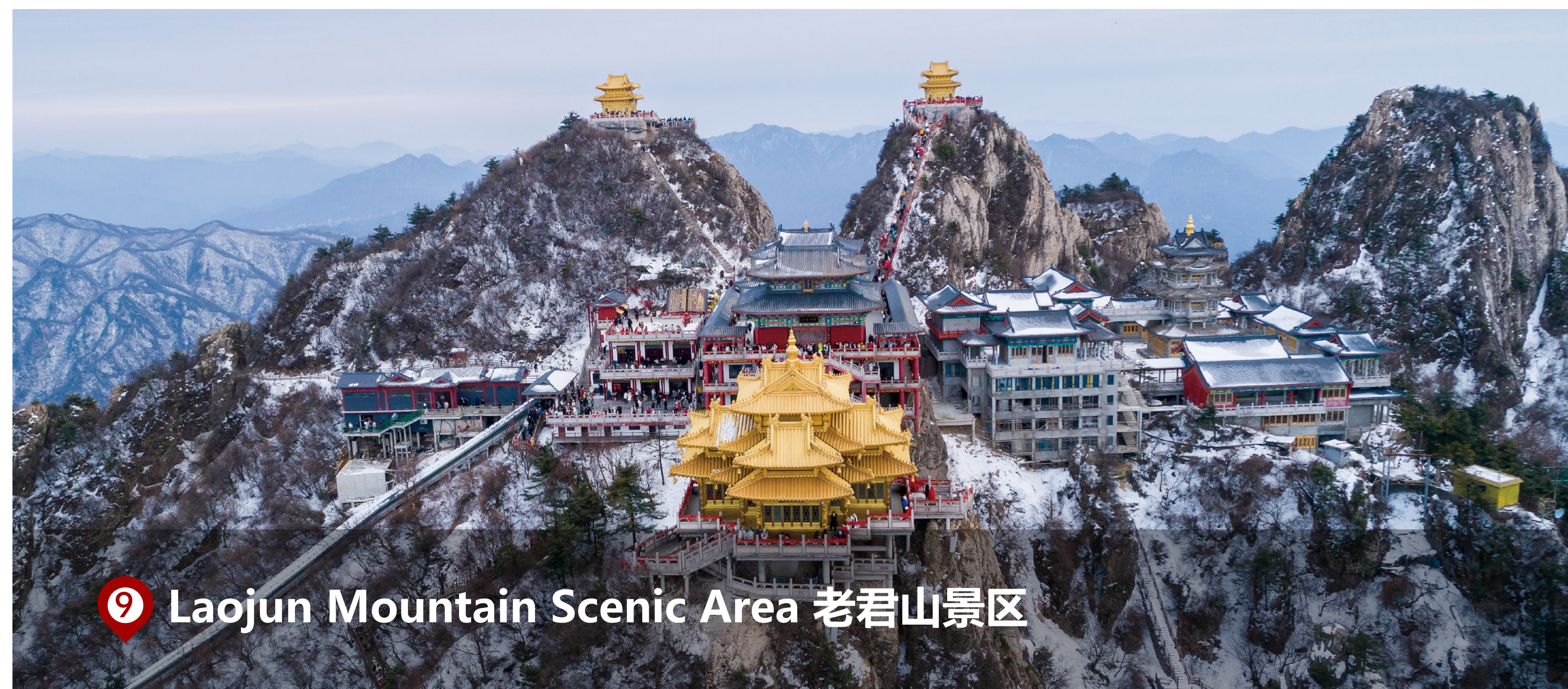
⑨ Laojun Mountain Scenic Area 老君山景区