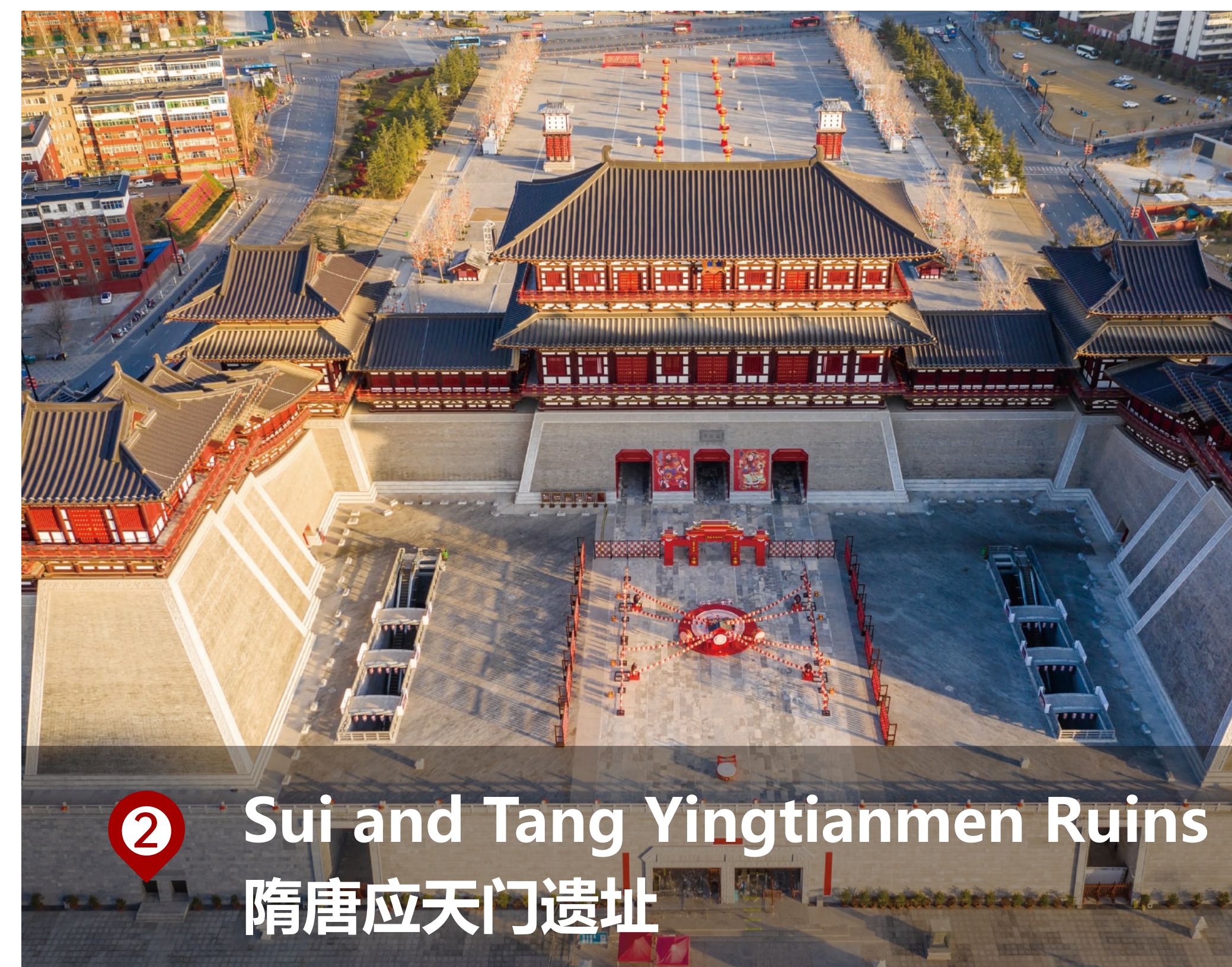
② Sui and Tang Yingtianmen Ruins 隋唐应天门遗址