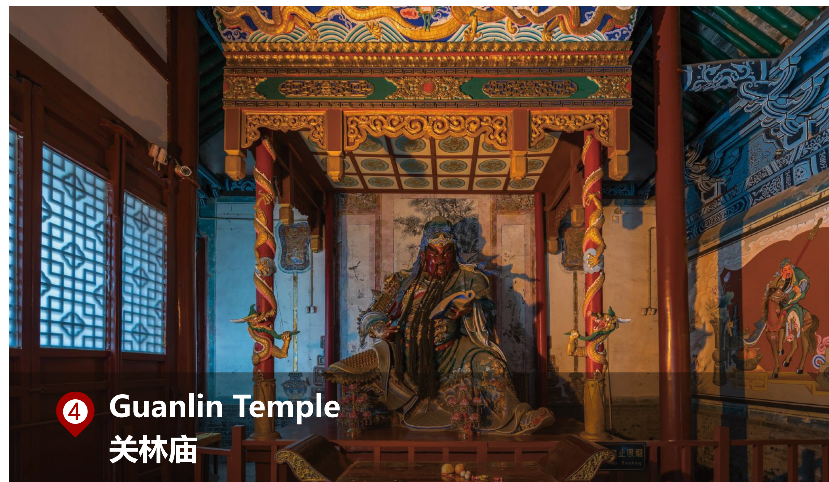
④ Guanlin Temple 关林庙