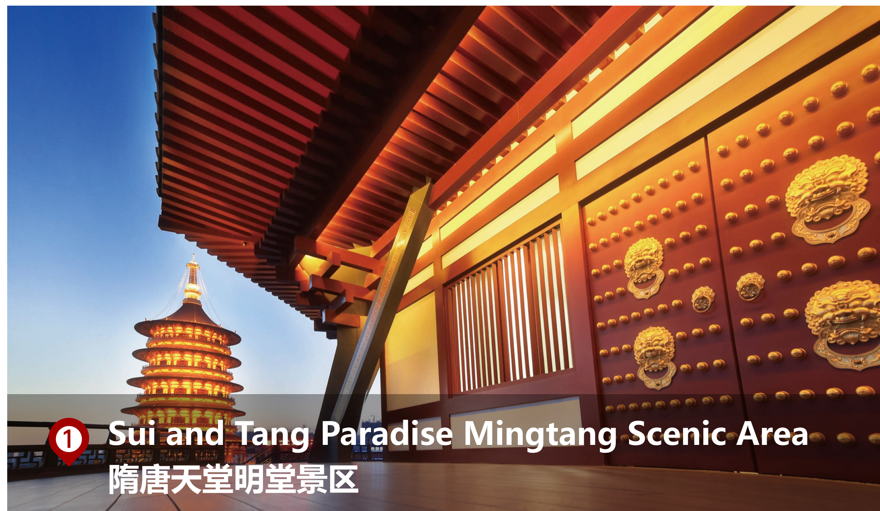
① Sui and Tang Paradise Mingtang Scenic Area 隋唐天堂明堂景区