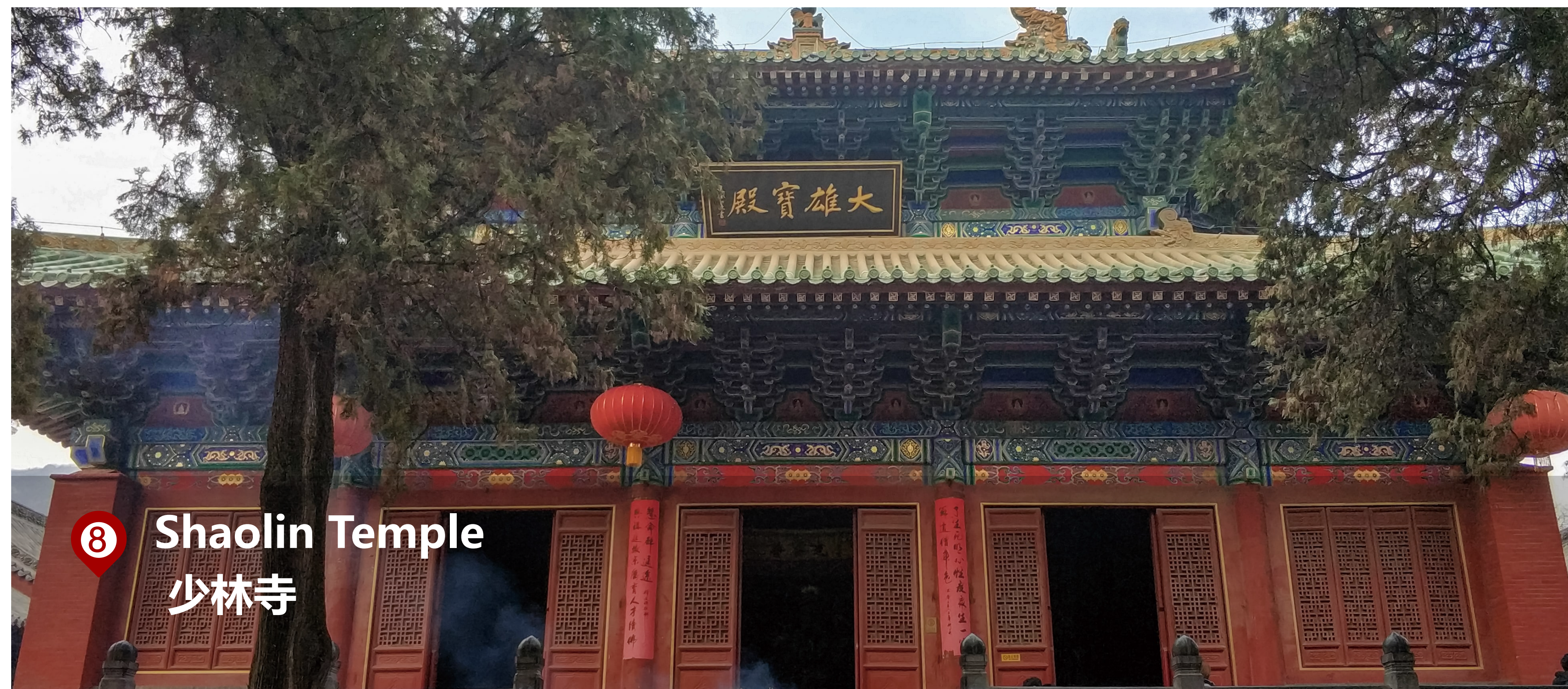
⑧ Shaolin Temple 少林寺