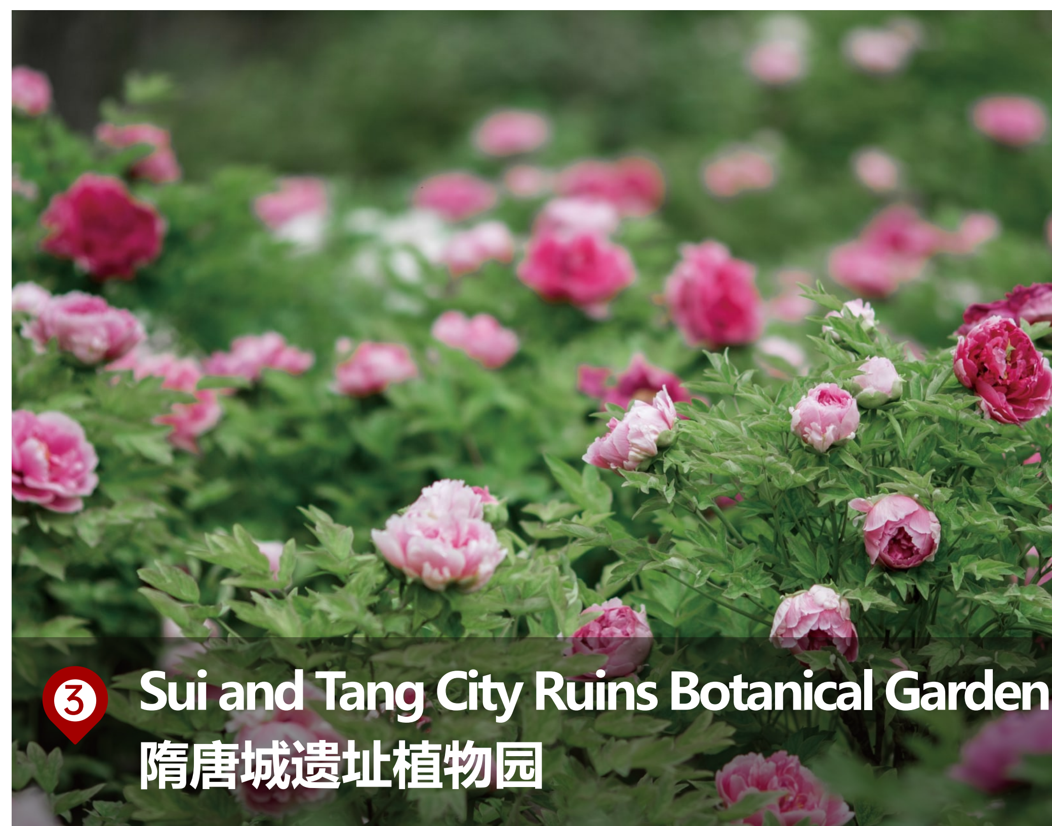
③ Sui and Tang City Ruins Botanical Garden 隋唐城遗址植物园