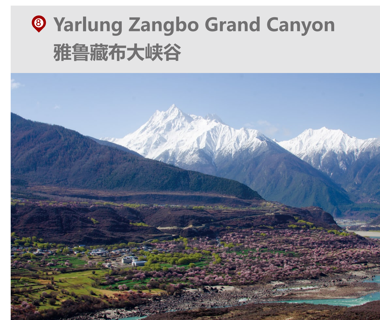
⑧ Yarlung Zangbo Grand Canyon 雅鲁藏布大峡谷

☉ Before July and after September, the plateau climate plus warm and humid air currents will make this place damp and cold.