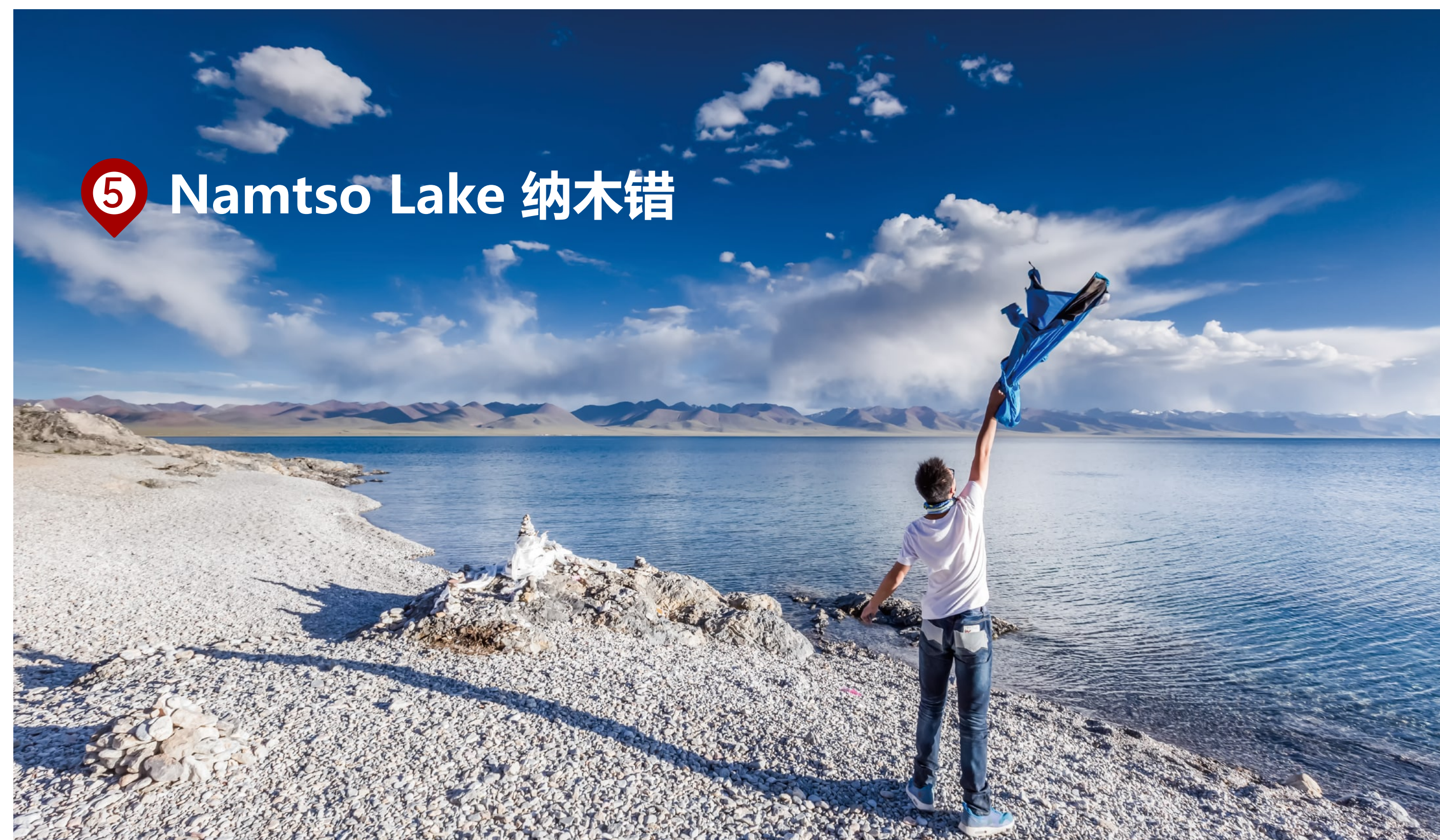
⑤ Namtso Lake 纳木错