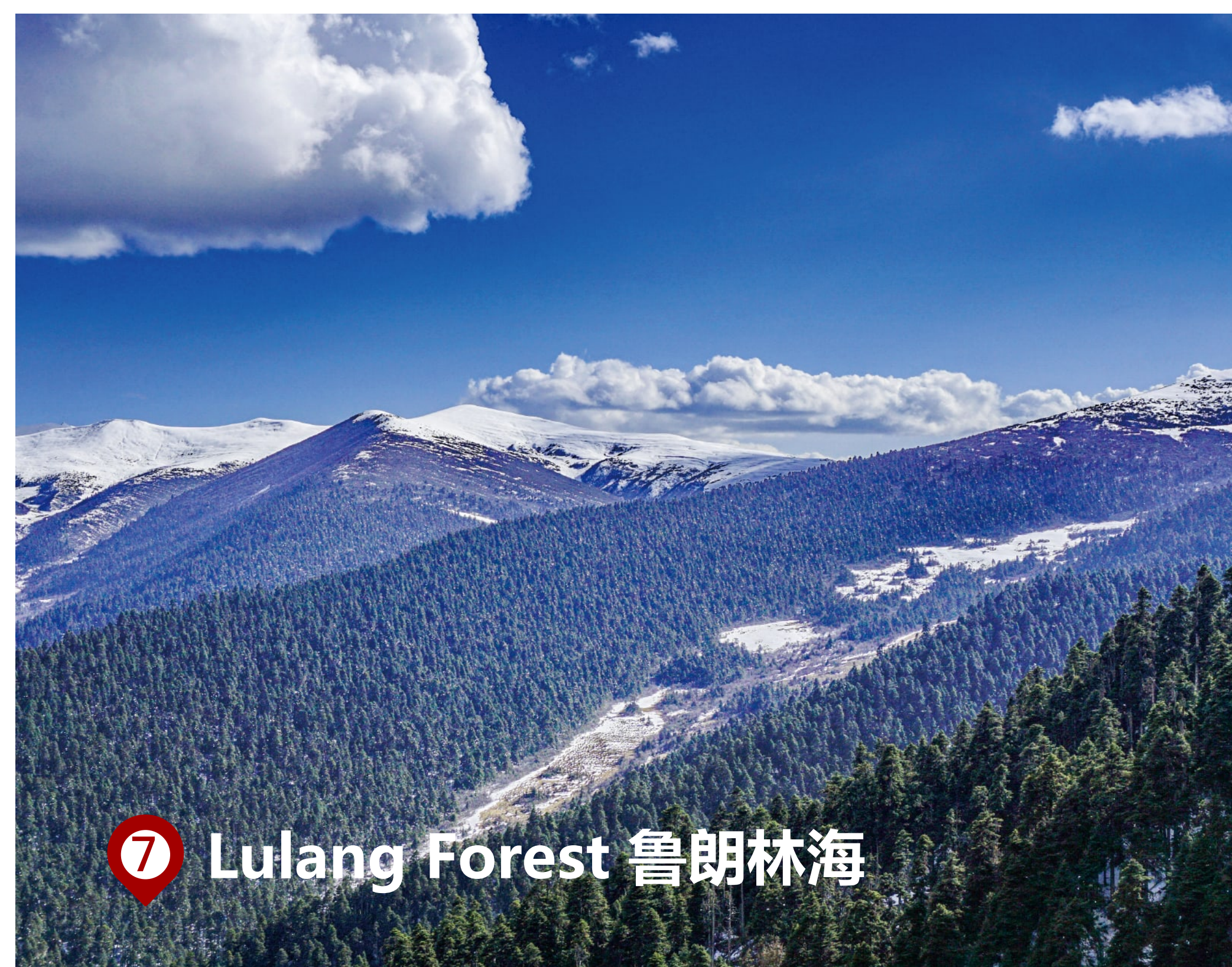
⑦ Lulang Forest 鲁朗林海