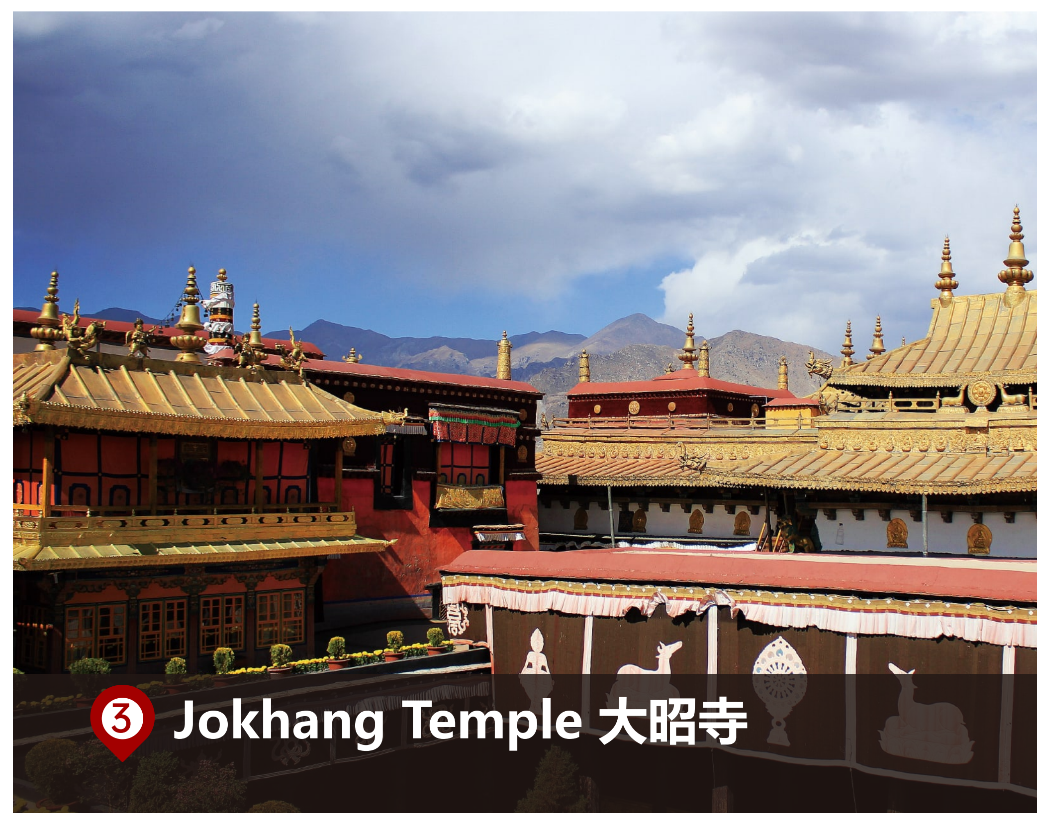
③ Jokhang Temple 大昭寺