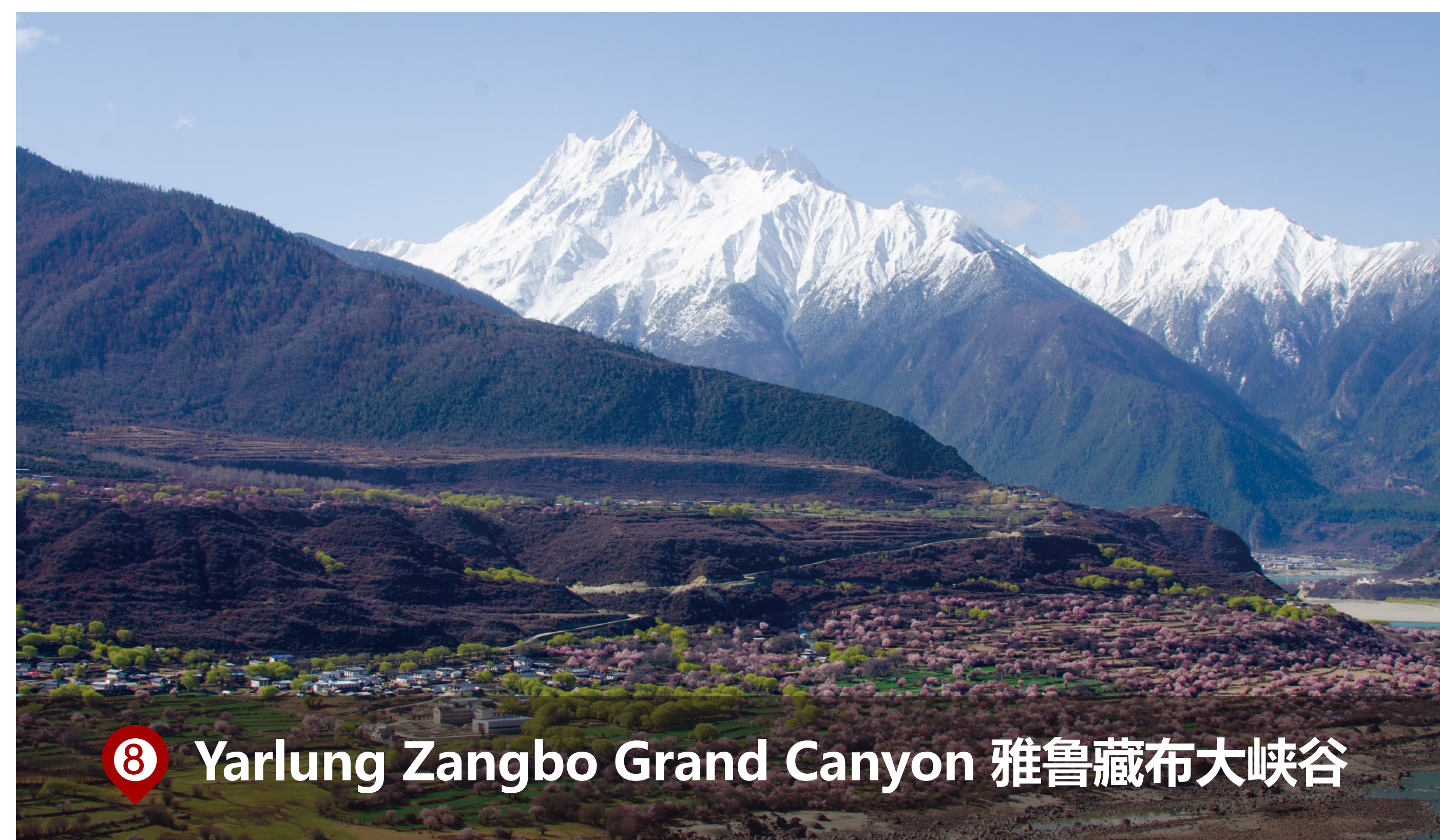
⑧ Yarlung Zangbo Grand Canyon 雅鲁藏布大峡谷