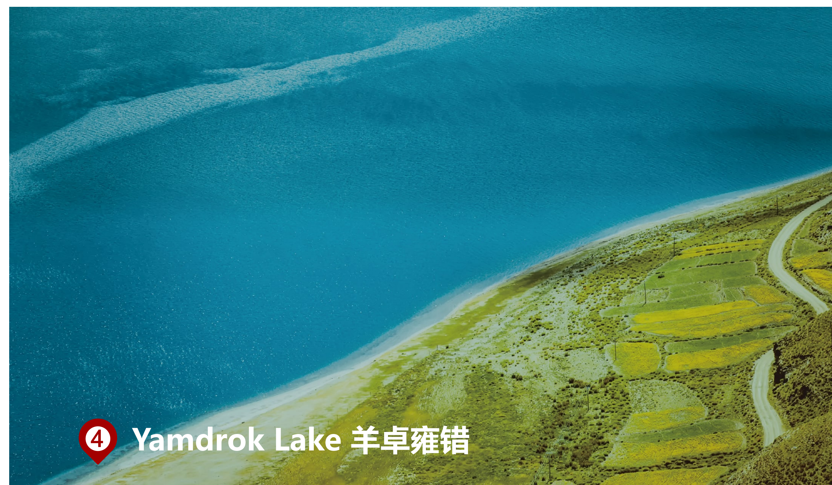
④ Yamdrok Lake 羊卓雍错