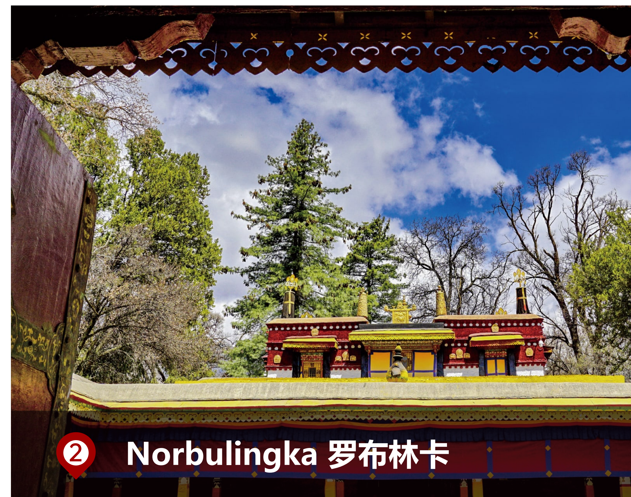
② Norbulingka 罗布林卡