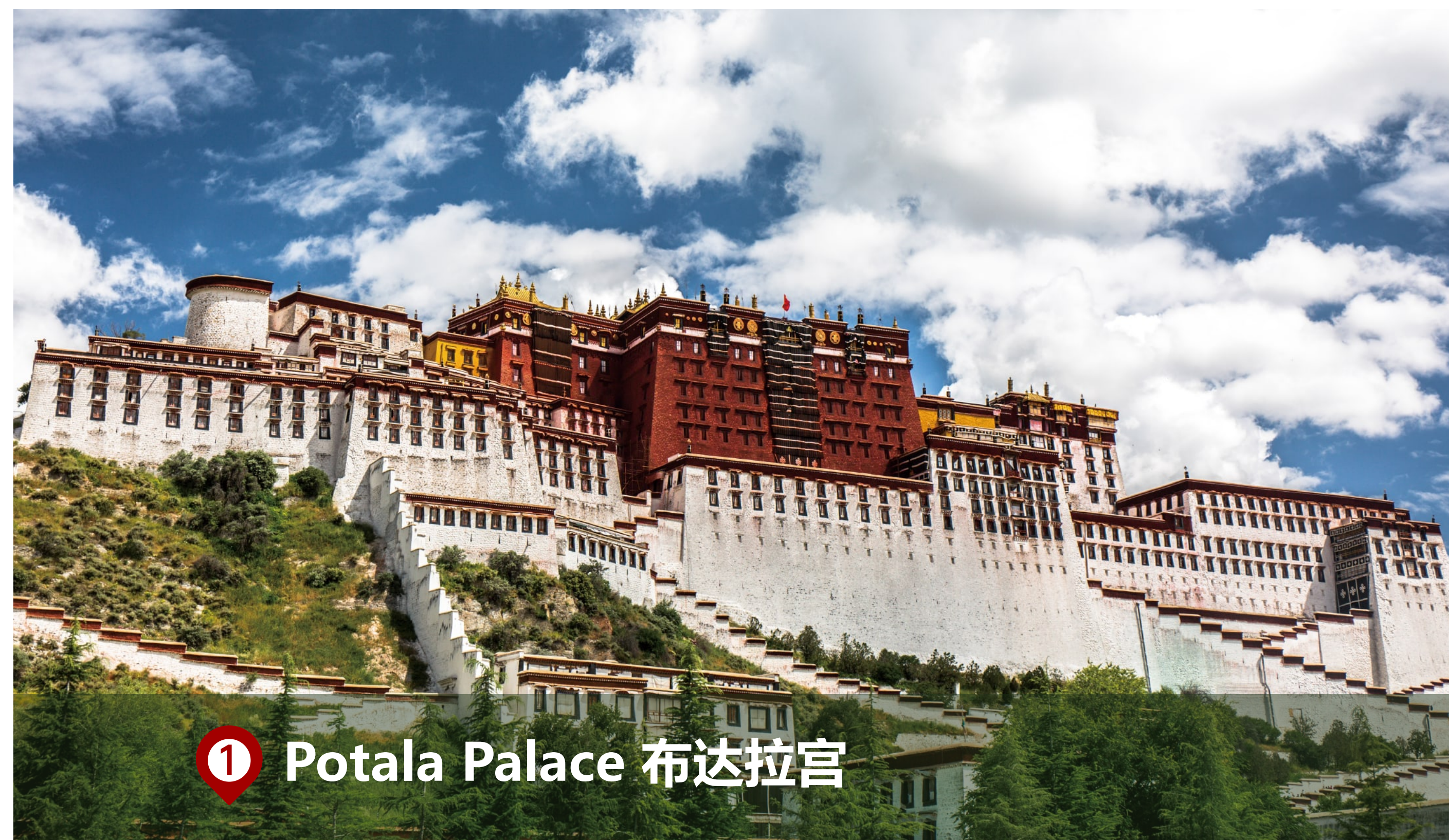
① Potala Palace 布达拉宫