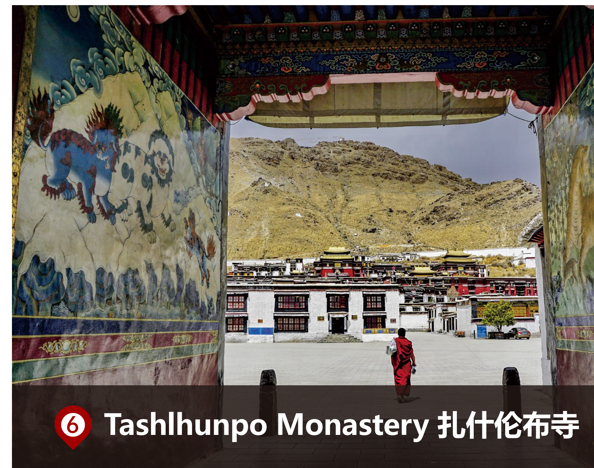
⑥ Tashilhunpo Monastery 扎什伦布寺